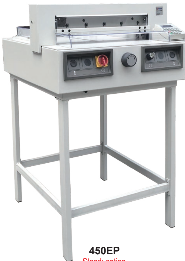
450EP Stand: option